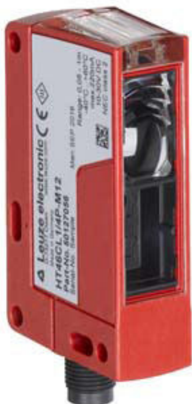
For illustration purposes only