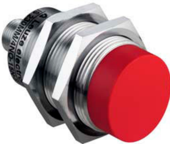
Figure can vary